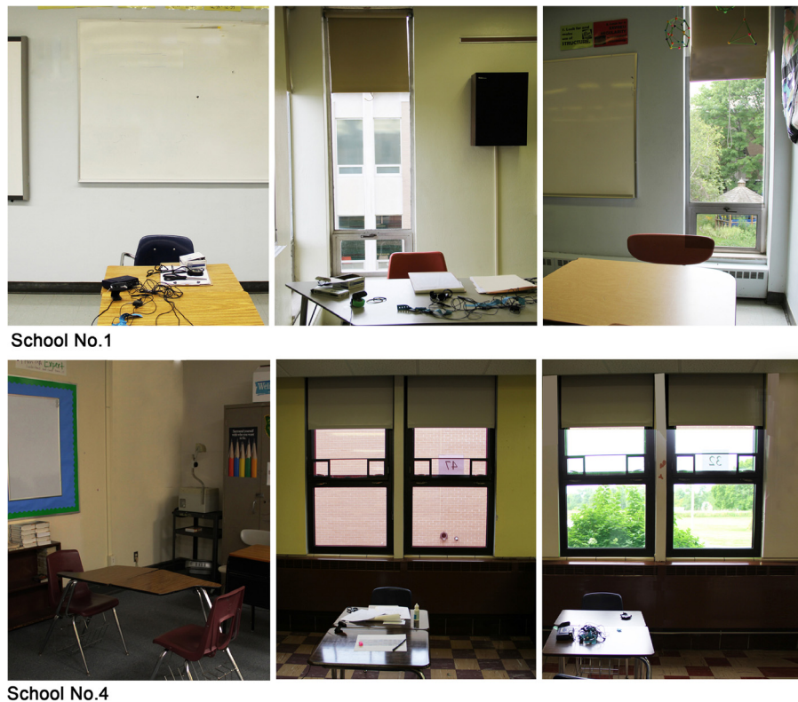
Fig. 1. Examples of classroom window view conditions: no window (left), windows opened on to built spaces (middle), and windows opened on to green space (right).

Conductance Level (SCL) and body temperature (BT) throughout the experiment by the clinical biofeedback device Procomp Infiniti Physiological System. These measures are the most widely employed methods for measuring physiological stress, and are often used together in research related to exposure to nature and stress recovery (Jiang et al., 2014a; Chang, Hammitt, Chen, Machnik, & Su, 2008).